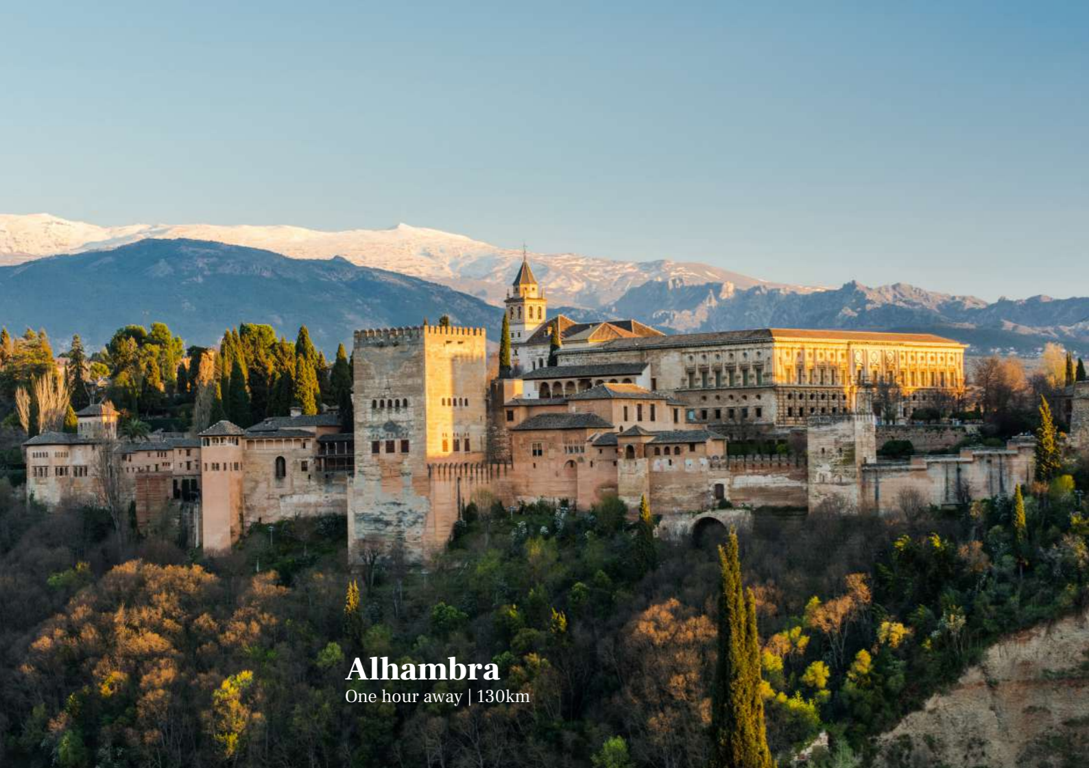
Alhambra One hour away | 130km